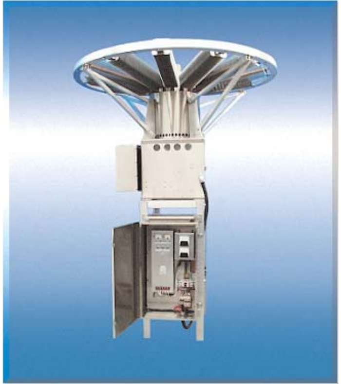
AUTOCP - 500 WATT - 24 - 12 WITH MODEL 8550 TEG

Global's Auto CP Interface Panel incorporates a fully featured DC/DC converter that maintains a preset constant voltage potential based on a permanently mounted reference half cell ( \text{CuSO}_4 ) signal. The Auto CP Interface Panel automatically adjusts the CP output to evolving CP circuit characteristics, as monitored by the reference half cell, providing a constant potential between Anode (+) and the structure to be protected. The Auto CP Interface Panel is available in 500, 300 & 200 Watt versions with 12 or 24 VDC inputs and 0-12, 0-24 outputs (consult factory for custom outputs).